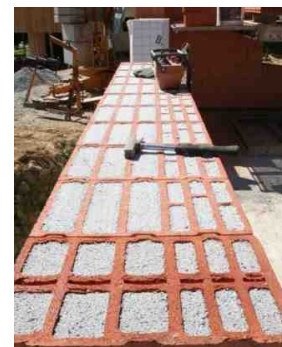
Wärmedämmziegel Poroton T8 U-Wert 0,18